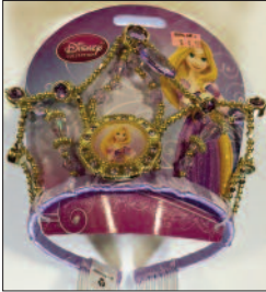
Cadmium, Cobalt, Antimony