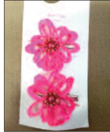
Arsenic, Cobalt, Mercury